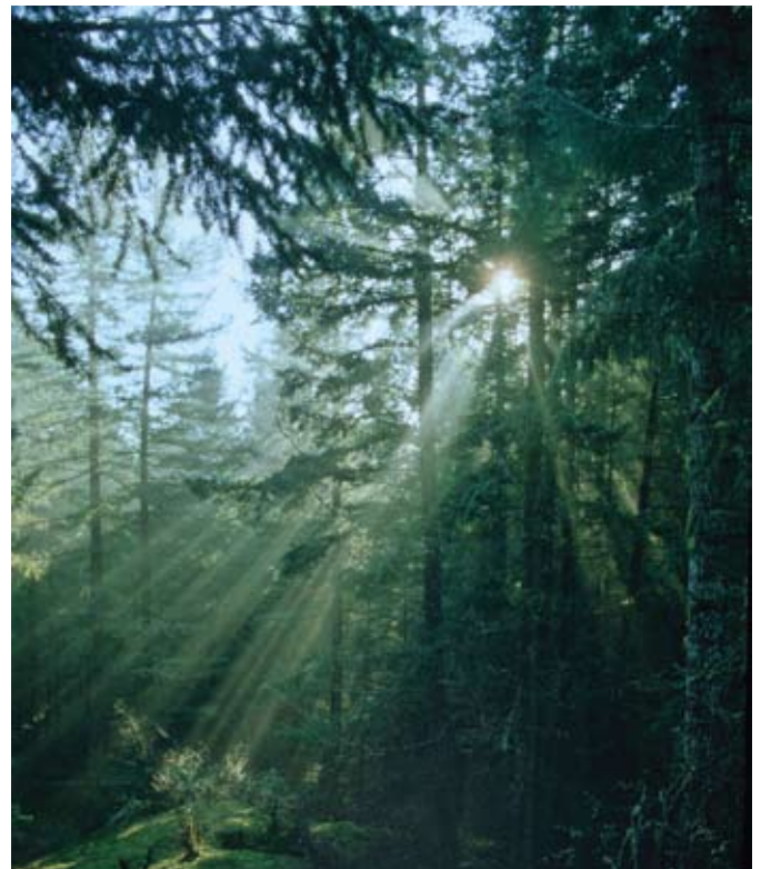
COASTAL DOUGLAS-FIR ECOSYSTEM.

hundred species at risk are found in the region. The Islands Trust Area supports some of Canada's last remaining Garry oak ecosystems and the associated rare plants, mosses, butterflies,