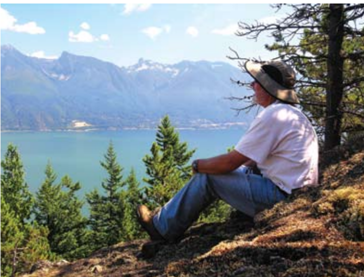
MOUNT ARTABAN LOOKING EASTWARDS FROM THE MOUNT ARTABAN NATURE RESERVE.

Free Crown Grants are transfers of Crown land from the province to public sector bodies, in particular municipalities and regional districts. With the support of the Islands Trust, the Trust Fund Board is working to acquire more lands in need of permanent protection through the Free Crown Grant program. For more information about Crown Land Grants visit: http://www.islandstrustfund.bc.ca/crown.cfm .